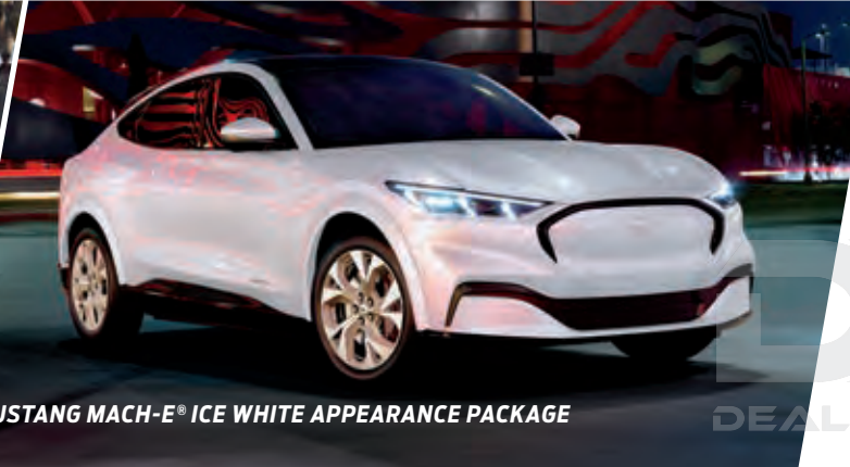
MUSTANG MACH-E® ICE WHITE APPEARANCE PACKAGE