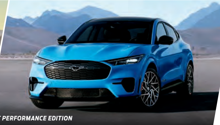
GT PERFORMANCE EDITION