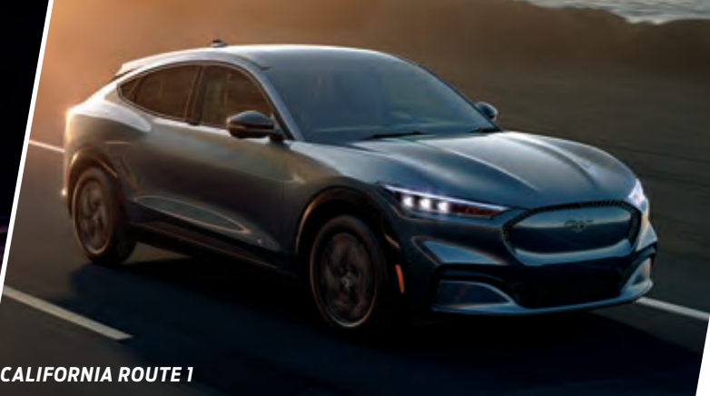
CALIFORNIA ROUTE 1