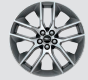
20" x 9" Foundry Black-Painted Machined Aluminum Optional: EcoBoost Premium, GT Premium