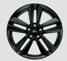
19" Ebony Black-Painted Aluminum Included: EcoBoost Performance Package