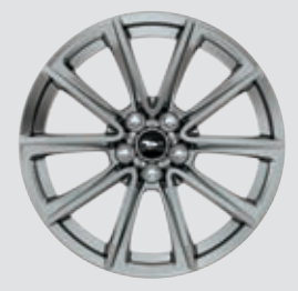
19" Premium Dark Stainless-Painted Aluminum Optional: GT Premium