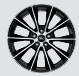
19" Low-Gloss Black-Painted Machined Aluminum Included: EcoBoost Interior & Wheel Package, Wheel & Stripe Package, GT Interior & Wheel Package