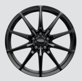
19" x 10.5" Front/19" x 11" Rear Ebony Black-Painted Aluminum Standard: Shelby GT350