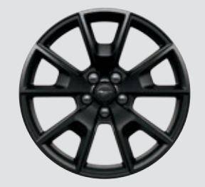
19" Ebony Black-Painted Aluminum Included: GT Black Accent Package