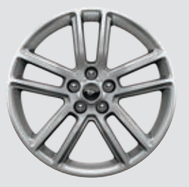
19" Polished Aluminum Included: EcoBoost Premium Pony Package