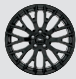
19" x 9" Front/19" x 9.5" Rear Ebony Black-Painted Aluminum Included: GT Performance Package