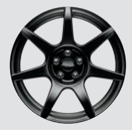
19" x 11" Front/19" x 11.5" Rear Ebony Black-Painted Carbon-Fiber Included: Shelby GT350R Package