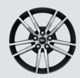
18" Magnetic-Painted Machined Aluminum Standard: EcoBoost<sup>®</sup> EcoBoost Premium, GT, GT Premium