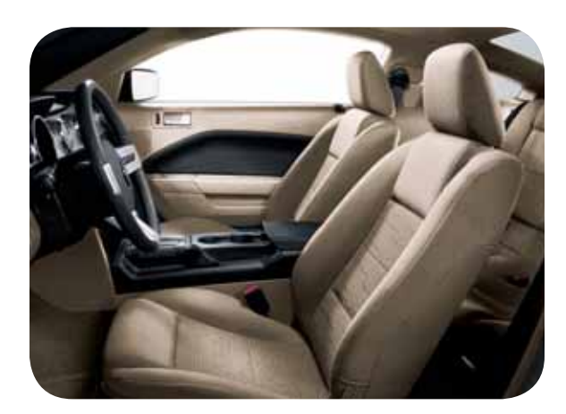
Mustang V6 Medium Parchment cloth Shown here – blended with the optional Interior Upgrade Package.

Mustang V6 option (pictured directly above) increases the wow factor. A sport tape stripe on the lower rockers and a seductive spoiler on the decklid do the eye-catchin' trick.