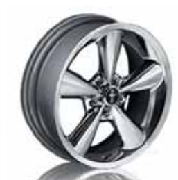
18" Polished-Aluminum with Tri-Bar Pony Center Cap Available on GT; Standard with GT California Special Package