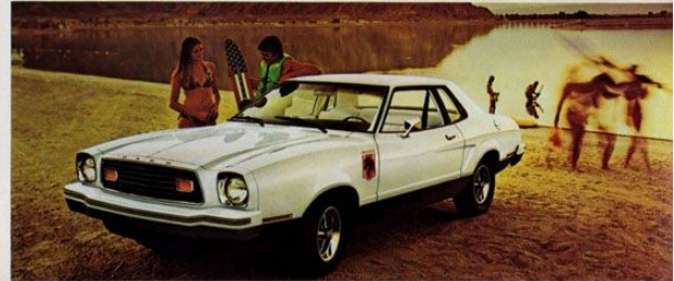
Mustang II MPG Hardtop

Mustang II MPG Stallion Hardtop (below) shows the exciting new look you get with a Polar White exterior (Code 9D) set off with Stallion Group items like: Black grille/bright surround molding, Black moldings/wiper arms, Black-painted lower fenders, lower doors, lower front/rear bumpers, rocker panels and all the other features listed for Stallion 2+2 on page 2. Other Stallion colors available in combination with Blackout areas and items are: Silver Metallic, Vermilion, Bright Yellow (see page 2), and Silver Blue Glow. Trim rings shown are optional.