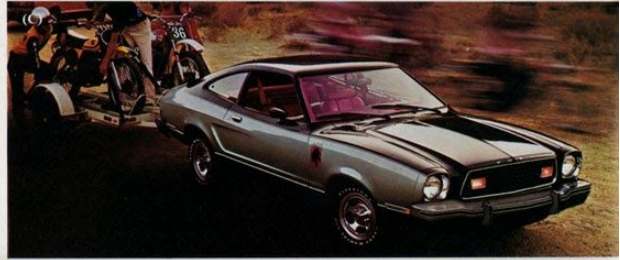
Mustang II Mach 1