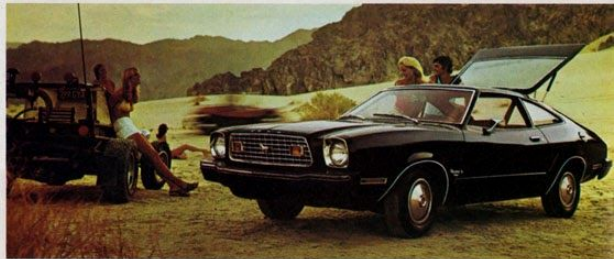
Mustang II MPG 3-Door 2+2 with Stallion Option Group

Mustang II MPG 3-Door 2+2 (below), in Black (Code 1C), features bright moldings throughout, and a bold, bright grille.